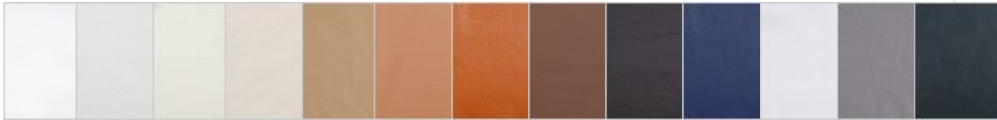
Porcelain White L201 Alpine White L203 Beige White L211 Sandstone L215 Driftwood Tan L219 Terra Brown L224 Golden Tan L227 Saddle Brown L231 Espresso Brown L235 Navy Blue L237 Nimbus Gray L238 Cloud Gray L239 Premium Black L244