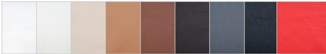
Arctic White L101 Polar White L103 Parchment L113 Earth Tan L124 Cocoa Brown L131 Java Brown L135 Charcoal Gray L139 Standard Black L143 Standard Red L147