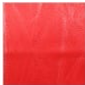
Premium Red L247