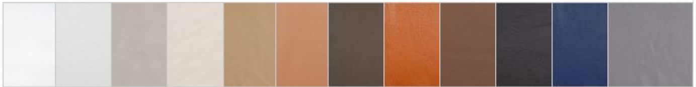
Porcelain White L201 Alpine White L203 Buff Tan L213 Sandstone L215 Driftwood Tan L219 Terra Brown L224 Taupe L229 Golden Tan L227 Saddle Brown L231 Espresso Brown L235 Navy Blue L237 Cloud Gray L239