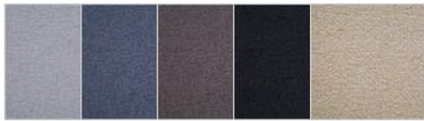
Smoke Gray F263 Winter Gray F264 Mica Gray F265 Midnight Black F266 Putty Tan F273