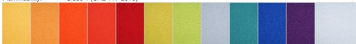
Citrus Yellow F216 Melon Orange F234 Tangerine Orange F235 Poppy Orange F236 Cayenne Red F223 Chartreuse Green F245 Lime Green F246 Powder Blue F253 Aegean Blue F254 Royal Blue F255 Plum Purple F257 Silver Gray F262

Fabric Name: Modern Boucle Fabric Content: 100% Post-Consumer recycled Polyester Weight: 22 oz/linear yard Finish: Greenshield™ (High Performance, Eco-friendly stain guard that beads liquids and easy to clean) Abrasion Resistance: 250,000 Double Rubs (ASTM D4157-13) Crocking: Wet: Class 5.0, Dry: Class 4.5 (AATCC 8) Light Fastness: Class 4.0 - 5.0 @ 40 hours (AATCC 16 3511) Pilling Resistance: Class 5.0 (ASTM D 3511) Seam Slippage: Warp: 79.5 lbs Fill: 133.0 lbs (ASTM D 4034) Tensile Strength: Warp: 177.0 lbs Fill: 234.0 lbs (ASTM D 5034) Flammability: Class 1 (CAL 117-2013)