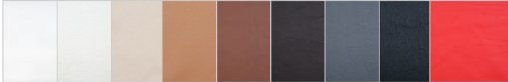
Arctic White L101 Polar White L103 Parchment L115 Earth Tan L124 Cocoa Brown L131 Java Brown L135 Charcoal Gray L139 Standard Black L143 Standard Red L147