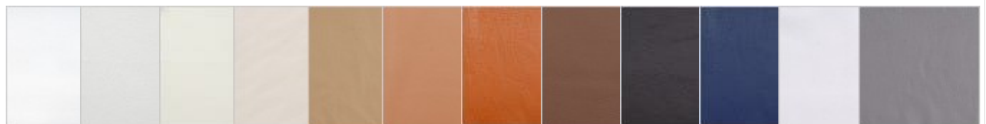
Porcelain White L201 Alpine White L203 Beige White L211 Sandstone L215 Driftwood Tan L219 Terra Brown L224 Golden Tan L227 Saddle Brown L231 Espresso Brown L235 Navy Blue L237 Nimbus Gray L238 Cloud Gray L239