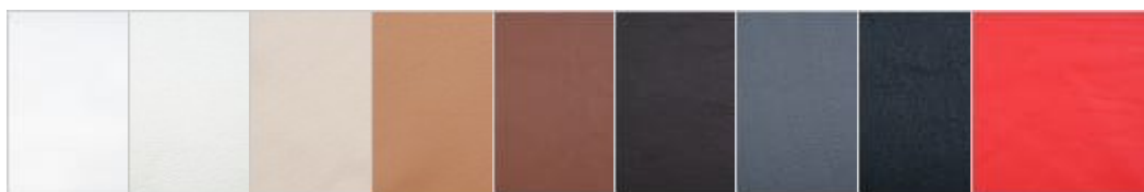
Arctic White L101 Polar White L103 Parchment L115 Earth Tan L124 Cocoa Brown L131 Java Brown L135 Charcoal Gray L139 Standard Black L143 Standard Red L147