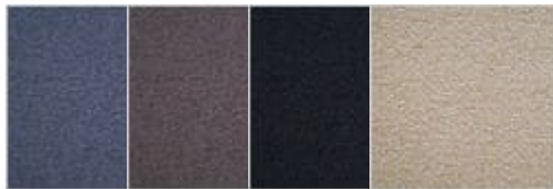
Winter Gray F264 Mica Gray F265 Midnight Black F266 Putty Tan F273

Product URL: https://www.modernclassics.com/store/pc/Florence-Knoll-Lounge-Chair-Shiny-Premium-Black-Leather-with-Buttons-1254p38450.htm