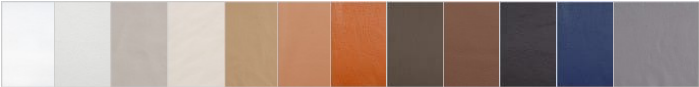
Porcelain White L201 Alpine White L203 Buff Tan L213 Sandston L215 Driftwood Tan L219 Terra Brown L224 Golden Tan L227 Taupe L229 Saddle Brown L231 Espresso Brown L235 Navy Blue L237 Cloud Gray L239

Click on any of these images for an enlarged view.