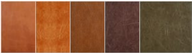
Harvest Tan L523 Caramel Tan L527 Clay Brown L531 Rich Brown L535 Olive Green L551