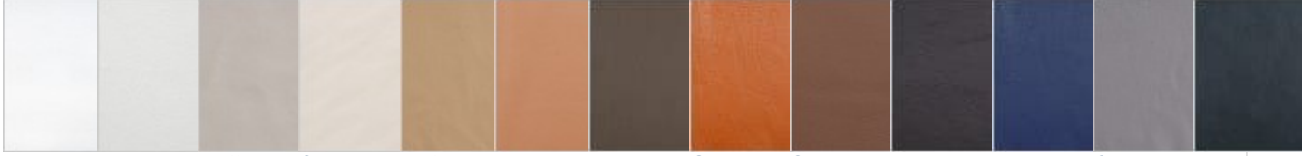
Porcelain White L201 Alpine White L203 Buff Tan L213 Sandstone L215 Driftwood Tan L219 Terra Brown L224 Taupe L229 Golden Tan L227 Saddle Brown L231 Espresso Brown L235 Navy Blue L237 Cloud Gray L239 Premium Black L244