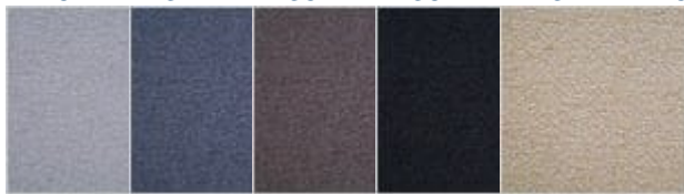
Smoke Gray F263 Winter Gray F264 Mica Gray F265 Midnight Black F266 Putty Tan F273

Product URL: https://www.modernclassics.com/store/pc/Modern-Classics-Morano-Office-Task-Chair-White-Back-2p50973.htm