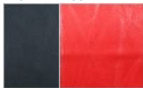
Premium Black L244 Premium Red L247