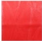
Premium Red Price Level 2 L247

Product URL: https://www.modernclassics.com/store/pc/Corbusier-Style-Grande-Ottoman-38p1285.htm