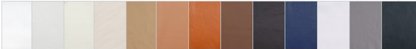
Porcelain White L201 Alpine White L203 Beige White L211 Sandstone L215 Driftwood Tan L219 Terra Brown L224 Golden Tan L227 Saddle Brown L231 Espresso Brown L235 Navy Blue L237 Nimbus Gray L238 Cloud Gray L239 Premium Black L244