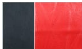
Premium Black L244 Premium Red L247