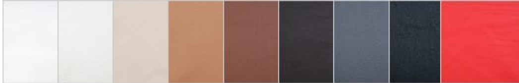
Arctic White L101 Polar White L103 Parchment L113 Earth Tan L124 Cocoa Brown L131 Java Brown L135 Charcoal Gray L139 Standard Black L143 Standard Red L147