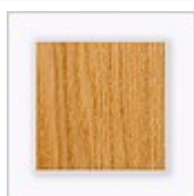
Oak Natural Finish