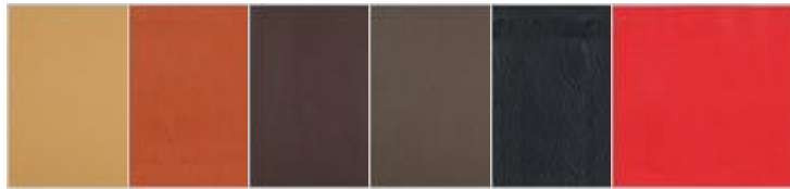
Camel Tan L427 Tuscany Brown L431 Kona Brown L435 Taupe Grey L439 Scandinavian Black L443 Scandinavian Red L447