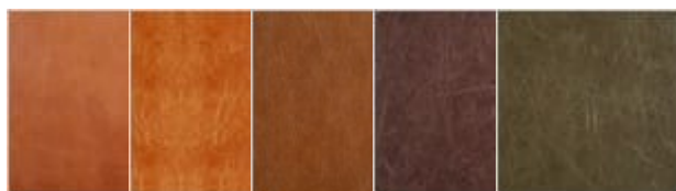
Harvest Tan L523 Caramel Tan L527 Clay Brown L531 Rich Brown L535 Olive Green L551