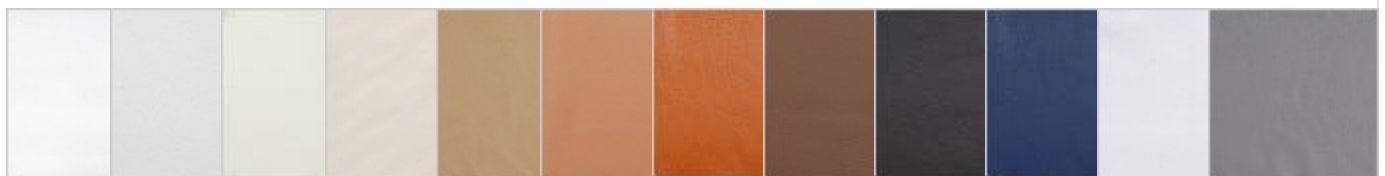
Porcelain White L201 Alpine White L203 Beige White L211 Sandston L215 Driftwood Tan L219 Terra Brown L224 Golden Tan L227 Saddle Brown L231 Espresso Brown L235 Navy Blue L237 Nimbus Gray L238 Cloud Gray L239