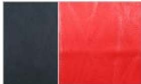
Premium Black L244 Premium Red L247