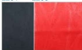
Premium Black L244 Premium Red L247

Product URL: https://www.modernclassics.com/store/pc/Mies-van-der-Rohe-Style-Exhibition-Counter-Height-Bar-Stool-9p23105.htm